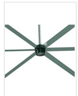
MacroAir HVLS Fans www.macroairfans.com