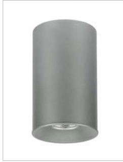
Atlantic Lighting www.atlantic-lighting.com