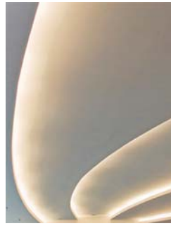
Dreamscape Lighting www.dreamscapelighting.com