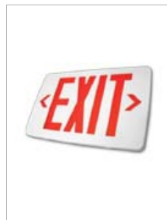
LifeSafety Lighting www.lifesafetylighting.com