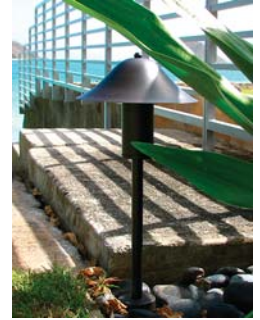
Beachside Lighting www.beachsidelighting.com