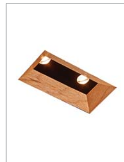
Specialty Lighting www.specialty-lightingindustries.com