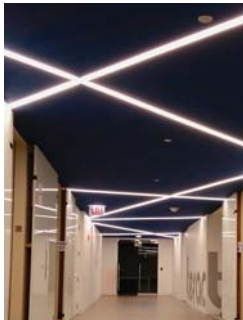
Dado Lighting www.dadolighting.com