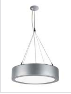
Zoom by Atlantic Lighting www.zoomlighting.com

The LIGHT represented brands presented on this line card manufacture specification grade architectural lighting light fixtures suitable for commercial and residential environments.