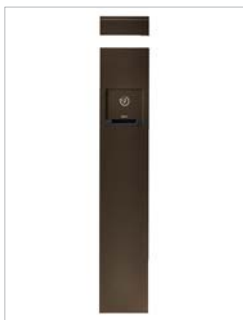
Legrand Outdoor Power www.legrand.us/outdoor