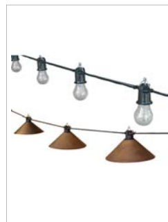
Primus Lighting www.primuslighting.com